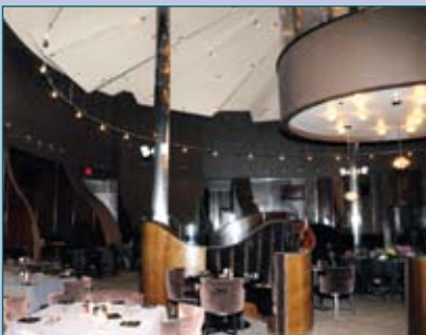
Cullen's Upscale American Grille Houston, TX