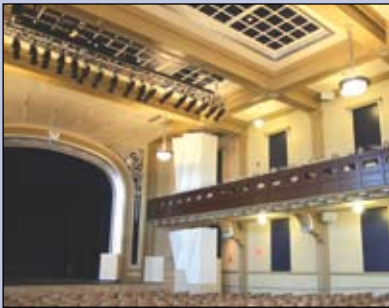
Johnson & Wales University Providence, RI