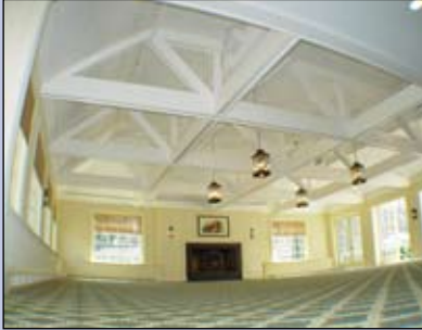
Bedens Brook Club Skillman, NJ