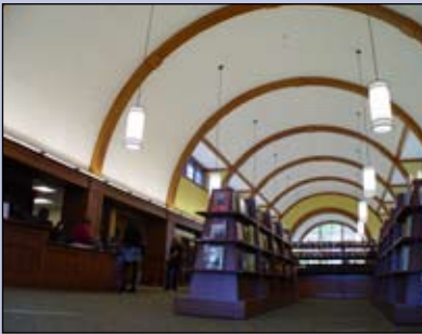
Townsend Library & Senior Center Townsend, MA